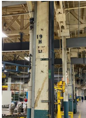
Post # H19

6.6 Report any fire emergency to RENK America security at once by calling the emergency number, (231) 724-2900. Be sure to give the exact location of the fire when you report it. At RENK America, post numbers are the best location references.