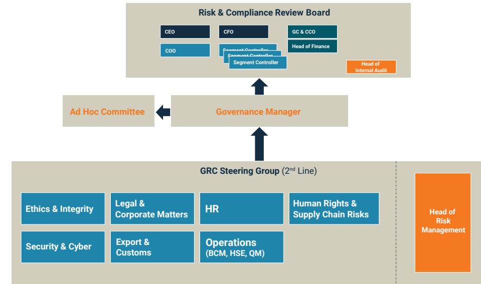
RENK's Risk & Compliance Review Board

one of several steering groups within the Risk & Compliance Review Board and reports any anticipated compliance risks to the Risk & Compliance Review Board on a quarterly basis. The Risk & Compliance Review Board comprises at least one member of the Management Board, the Chief Compliance Officer, the Segment Controllers, the Head of Finance, and the Head of Internal Audit.