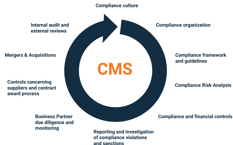
RENK Compliance Management System

The CMS at RENK is based on generally acknowledged principles and is structured along the following core elements.